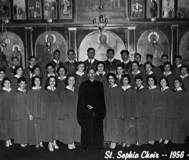
St. Sophia Choir -- 1956 -